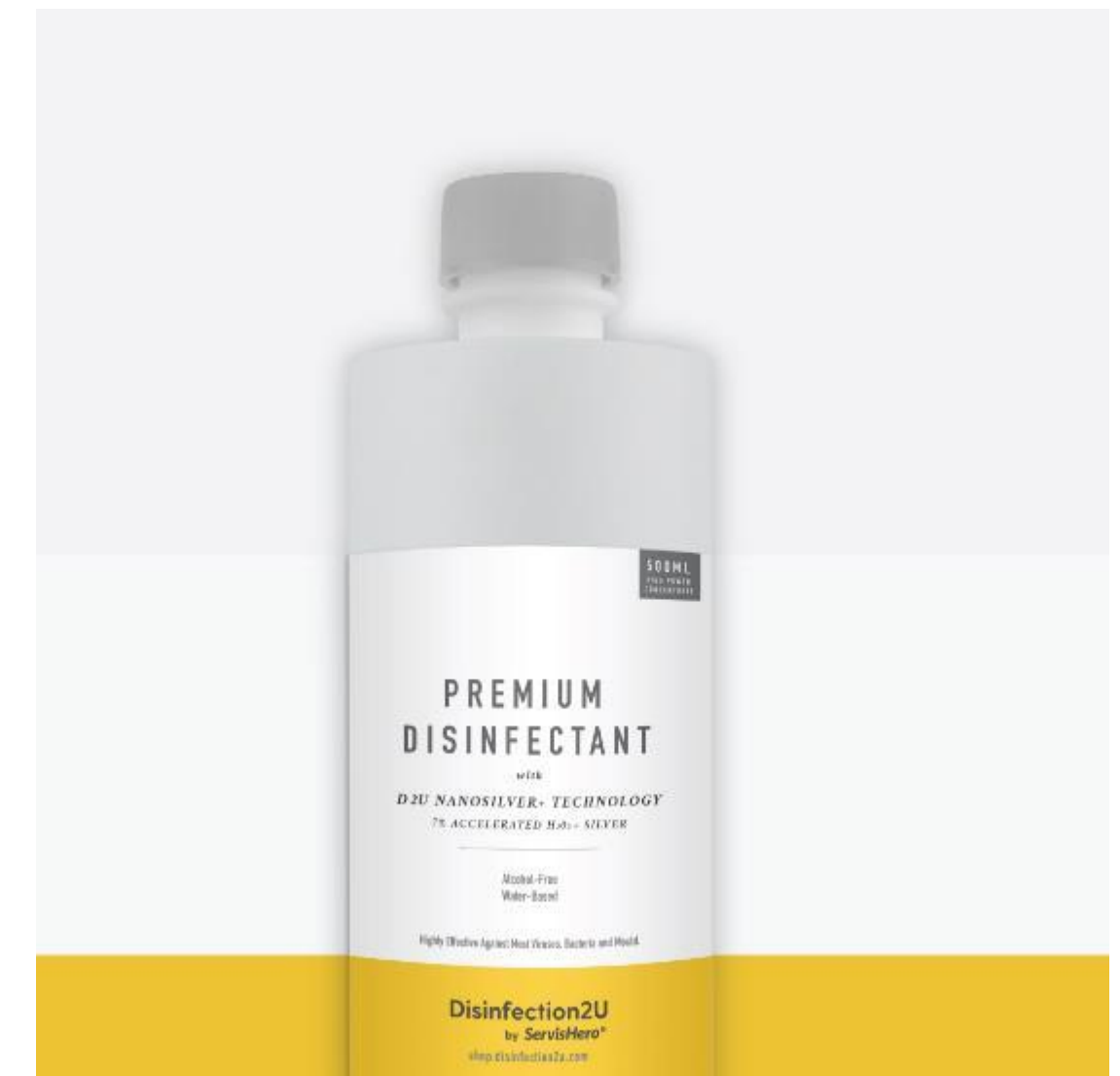
D2U PREMIUM H2O2 DISINFECTANT