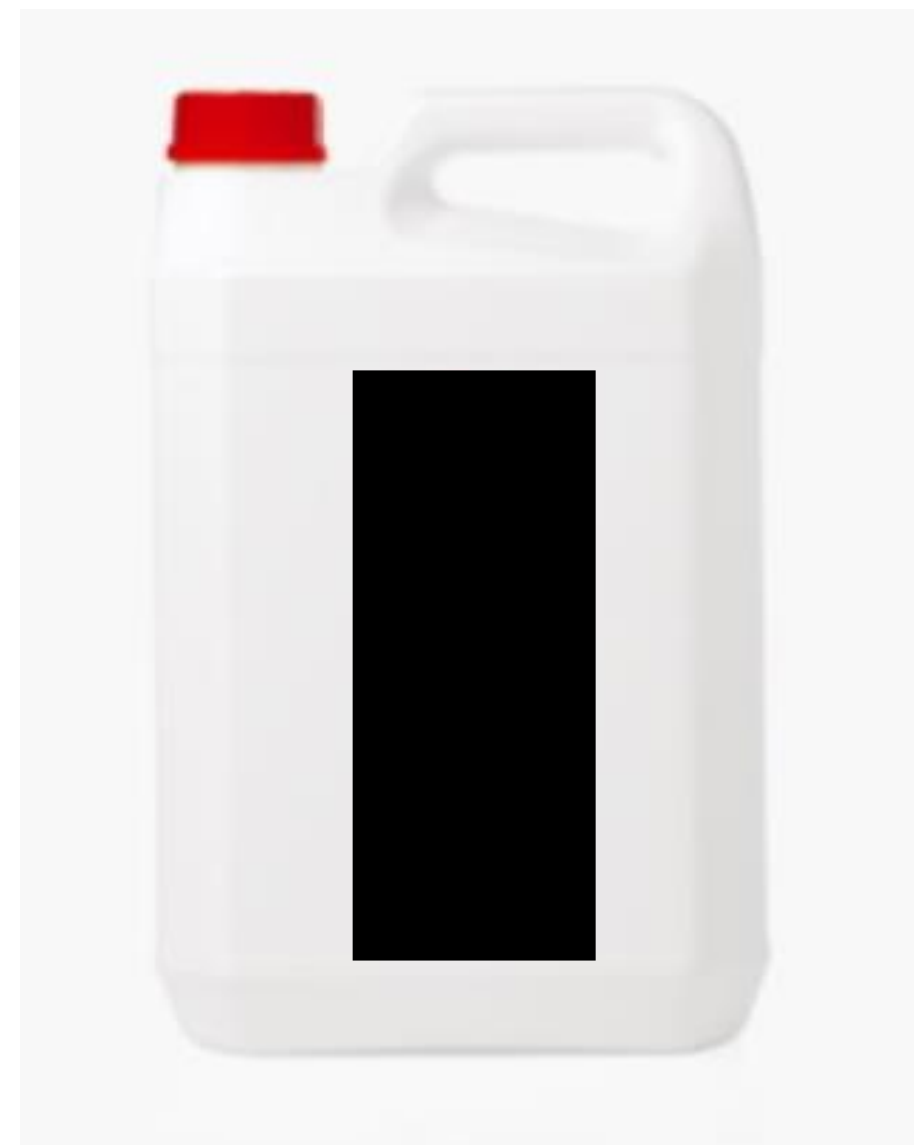
PREMIUM EUROPEAN-BRAND H2O2