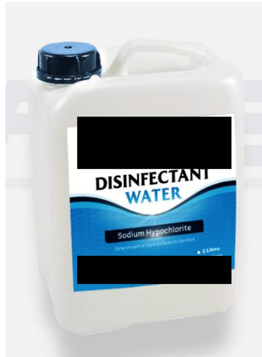
TYPICAL CHLORINE DISINFECTANT

We cut out the middle-man to give you the most cost-effective disinfectant. Factory direct prices.